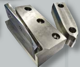
5-axis milling center